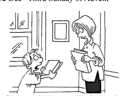
"No joystick? No mouse? No keyboard? How do you turn the pages?"

28 Nov First Sunday of Advent 5 Dec Second Sunday of Advent 10 Dec Last day School Term 4 12 Dec Third Sunday of Advent